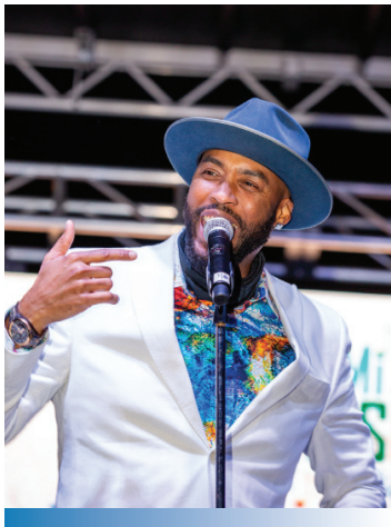
Montell Jordan 2022

Targeting a diverse audience with award winning performers.