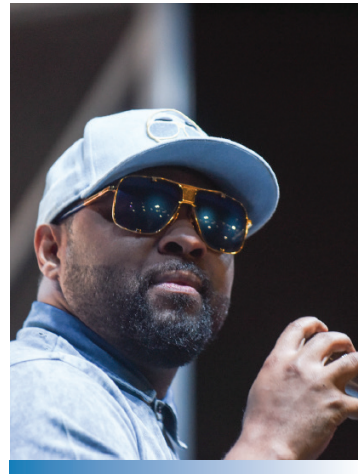
Musiq Soulchild 2022