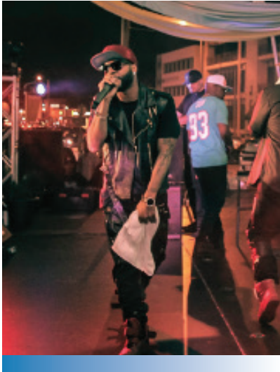
Jagged Edge 2016

Who are the customers you want to reach?