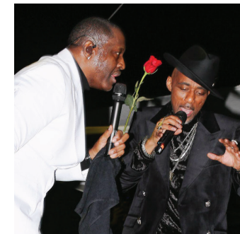
Johnny Gill and Ralph Tresvant