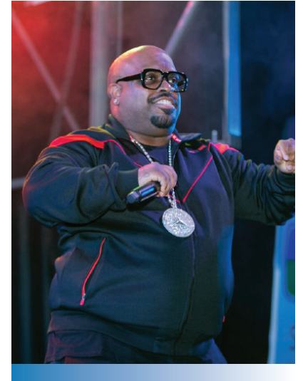
Ceelo Green 2020